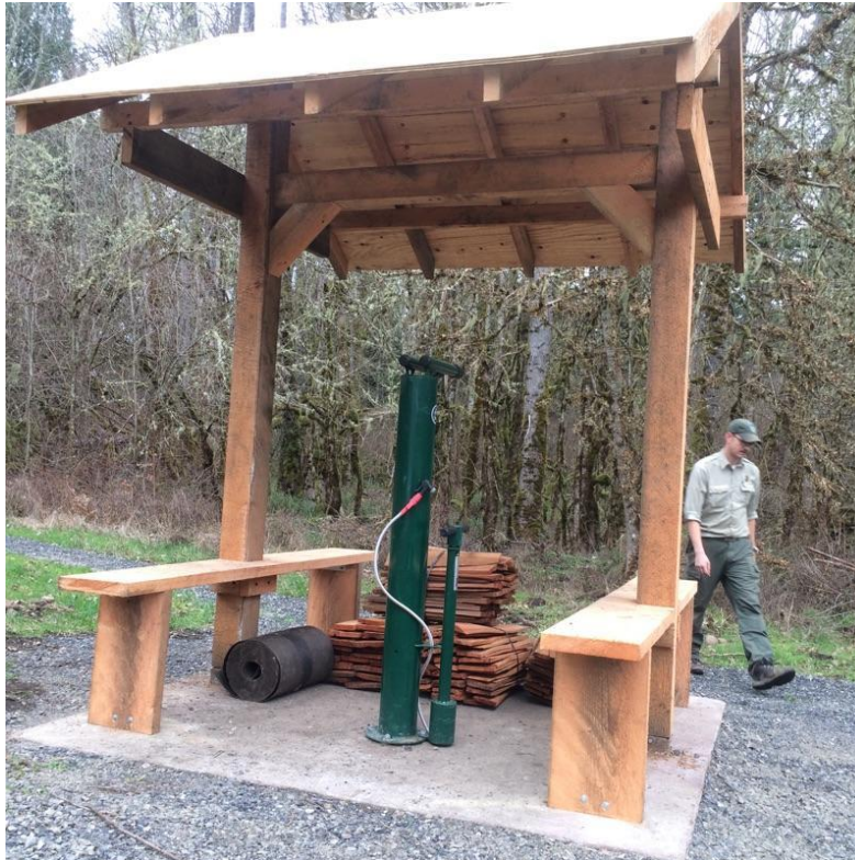
Milo McIver area hiker/biker site